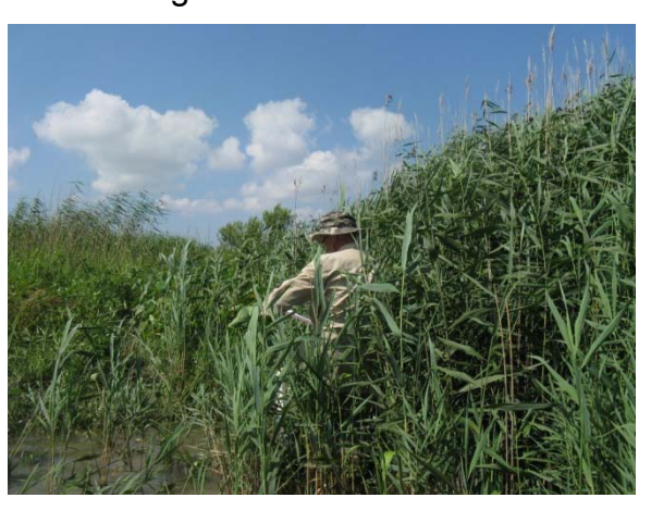
d. Introduced Phragmites australis : Delta sublineage