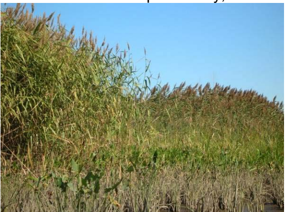
c. Introduced Phragmites australis – Rhode River, western shore Chesapeake Bay, MD

a. Phragmites australis subsp. americanus (left) and introduced Phragmites australis (right), Kings Creek, eastern shore Chesapeake Bay, MD