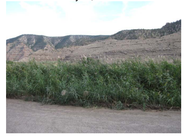
a. Phragmites australis subsp. americanus Nine Mile Canyon, UT