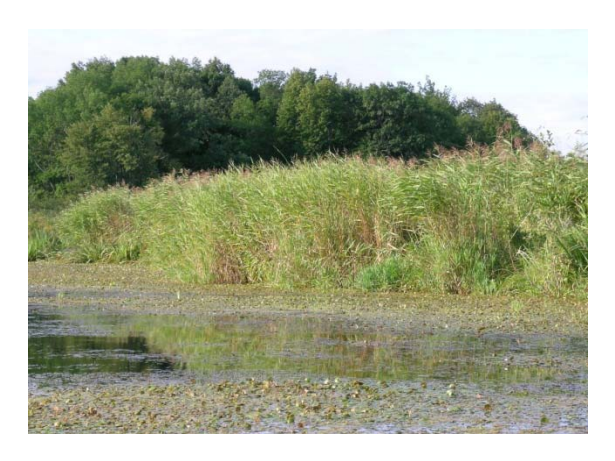
d. Introduced Phragmites australis – Sediment basin, Beauharnois, Quebec, Canada

b. Phragmites australis subsp. americanus , Lake Saint-Francois Wildlife Area, Dundee, Quebec, Canada