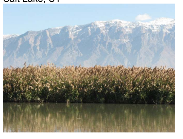
c. Introduced Phragmites australis - Harold Crane Waterfowl Management Area, Great Salt Lake, UT