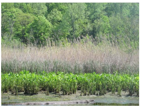
d. Introduced Phragmites australis – South River, western shore Chesapeake Bay, MD

b. Phragmites australis subsp. americanus , Parkers Creek, western shore Chesapeake Bay, MD