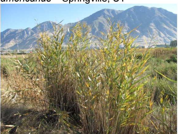
b. Phragmites australis subsp. americanus – Springville, UT