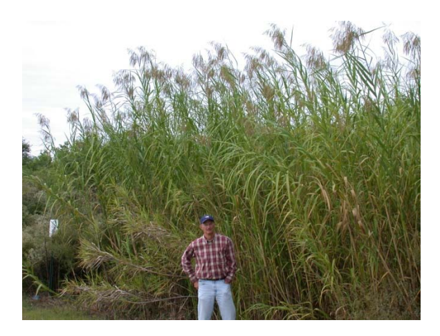
c. Introduced Phragmites australis : Short B sublineage