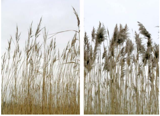
c. Introduced Phragmites australis – Highway 30, south of Montreal, Quebec, Canada

a. Phragmites australis subsp. americanus (left) and introduced Phragmites australis (right), Lake Saint-Francois Wildlife Area, Dundee, Quebec, Canada